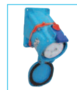
Female Receptacle with Angle Adapter 33-64043 + MP6